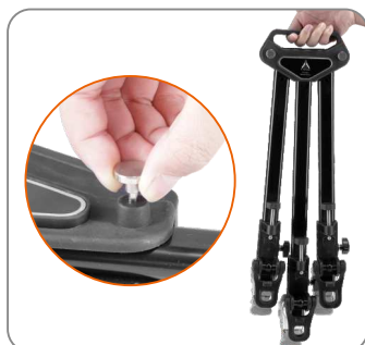
Pull the knob to extend the dolly, easy to go out.