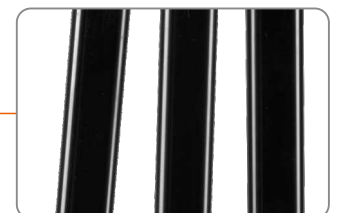
High quality aluminum tube.