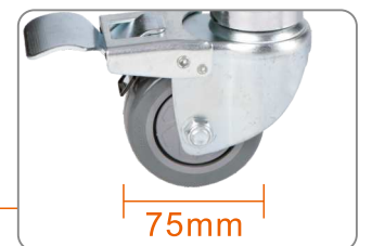
The rubber wheels are non-marring during normal use, protecting the floor surface.