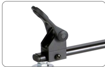
Leg setting rubber.

It comes with fully adjustable leg locks to fit almost all full-size tripods, not only the horseshoe feet but also the nail feet and rubber feet. It features on-step easy lock, locking wheels to secure the tripod.