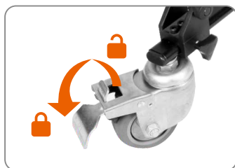
Each wheel incorporates its own foot-activated brake.