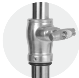
Sturdy riser with T-shaped handle.