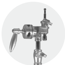
Overhead with 5/8" Stud.