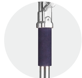
Non-slip high density foam cover.