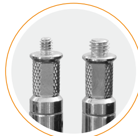
1/4" and 3/8" stud at the end of arm.