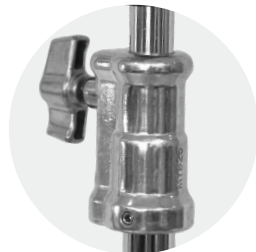
Stronger riser to lock more tightly.