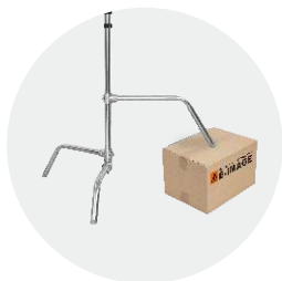
Sliding leg for uneven surfaces or stairs.