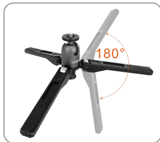
Fold-out legs design.