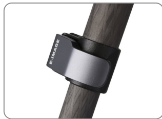
Flip type locking system.