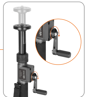
Geared center column provides extra height.