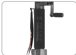
Foam cover on top section of tripods provides a secure and comfortable grip.