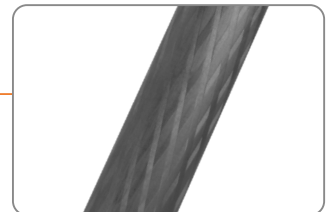
High quality carbon fiber tube.