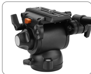
GH03F Fluid head.

E-IMAGE ML-900C new designed monopod with geared center column is extremely solid and wobble free. Geared center column provides extra height if you need to get your camera high up, it can be used on moving shooting and other events, which is easier to use than hand-head. It integrates the monopod, sticks and low profile tripod into one. Easy to get functions switching and it is a great choice for travel and outdoor shooting.