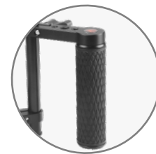
Comfortable, adjustable rubber handgrips allow for portability

Designed to fit monitors up to 9", this Director's Monitor Cage with Rubber Handgrips from E-Image helps directors stay mobile while managing a complex production. Constructed with durable, lightweight aluminum, the cage is modular and adjustable to support a monitor, a battery mount, and even a wireless transmission system.