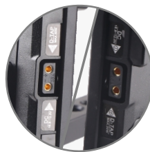
V-lock battery mount comes with two B interface at the both sides