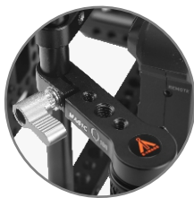
Covers with multiple 1/4" and 3/8" mounting threads