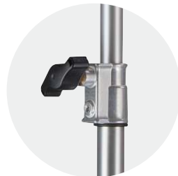
Ergonomic knob use comfortably and lock quickly.