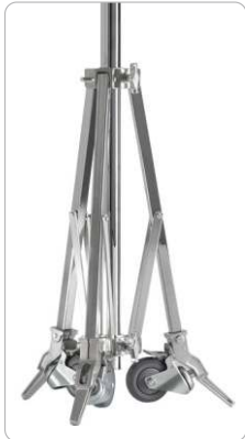
Remains Standing While Folded