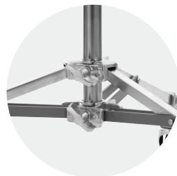
Center column can be againsted the ground.