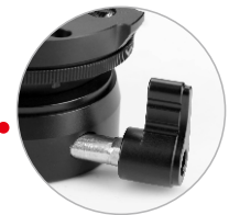
The knob can be pulled out to adjust the angle to prevent collision