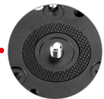
Non-skid rubber increase the friction to prevent cameras from falling down.