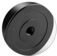
3/8" Screw hole