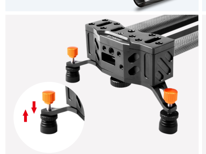
Height adjustable feet that spread out in triangular form, add extra stability to the slider.