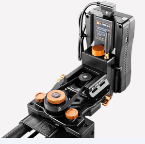
Optional Motor 1 are available that make it motorized, can make time-lapse, stop-motion, trace record.