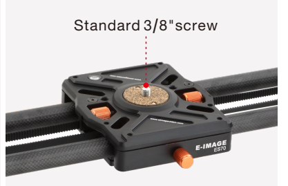
Suitable for different sizes of cameras.