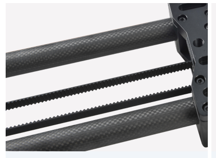
All tubes adopt pure 16x carbon fiber material. Lightweight, big payload, extremely sturdy and durable.