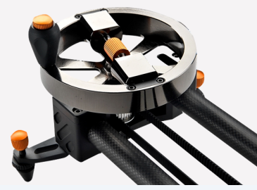
Fly wheel adds a damping effect that ensure smooth acceleration/ deceleration.