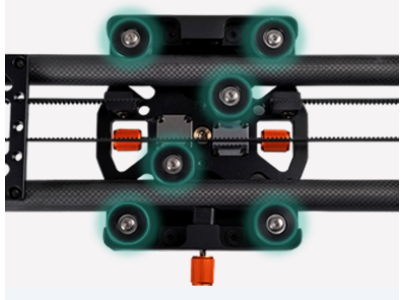
High quality silent bearing imported from Japan and synchronous belts, make the movement in perfect smooth and in silence.