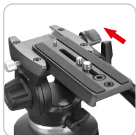
GP1 quick release plate.