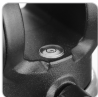
A built-in bubble level to assist balancing.