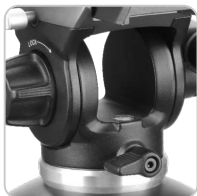
Fixed pan & tilt drag for smooth movement.