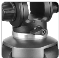
65mm bowl size.