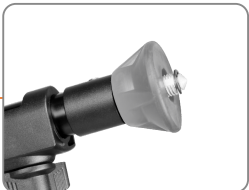
Adjustable tripod feet to meet different ground conditions.