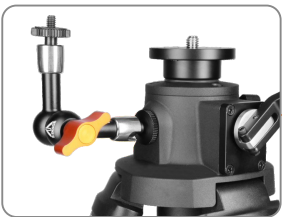
Parking holes for accessories. (Monitor、LED light.....)