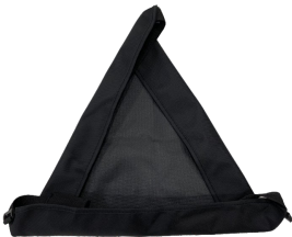
ST-1 Stone bag