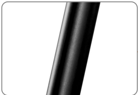
High quality aluminum tube.