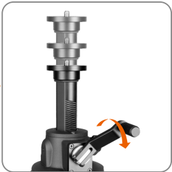
With Geared adjustable center column, the max height of tripod can reach up to 2.3m.