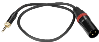
XLR to 3.5mm Cable