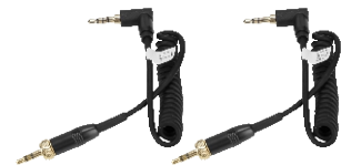
TRRS Cable (For Phone) x1 TRS Cable (For Camera) x1